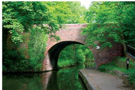
The Old Viarres Bridge, Acocks Green, Birmingham

Canal bridge no.86 at Woodcock Lane has been given a Grade II listing, and funds have been secured for repairs ensuring conservation of the bridge as a local example of original canal architecture.